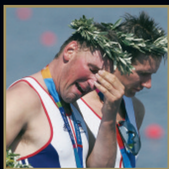
SIR MATTHEW PINSENT